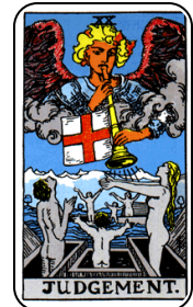
3. Tuesday (Mars) Judgement