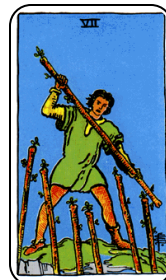
4. Wednesday (Mercury) Seven of Wands