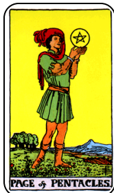
5. Thursday (Jupiter) Page of Pentacles